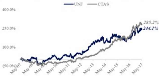
TSR: Last 10-years Under Ron (May 2007 – May 2017)